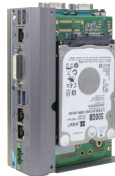
▲ POC-300 with Mezio™ - R11 and 2.5" HDD

** For sub-zero operating temperature, a wide temperature HDD drive or Solid State Disk (SSD) is required.